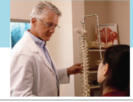
Act now, call our free information line today about SpineMED<sup>®</sup> Spinal Disc Decompression at: